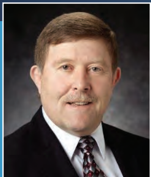
Bernard P. Harrison Award of Merit