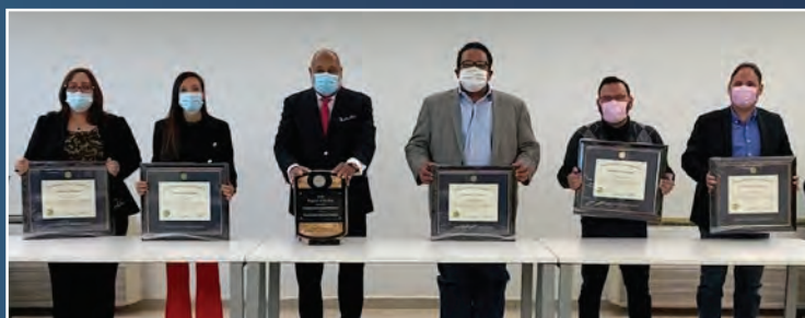
Program of the Year

Complejo Correccional de Bayamón, Puerto Rico, Transformative Education Institute