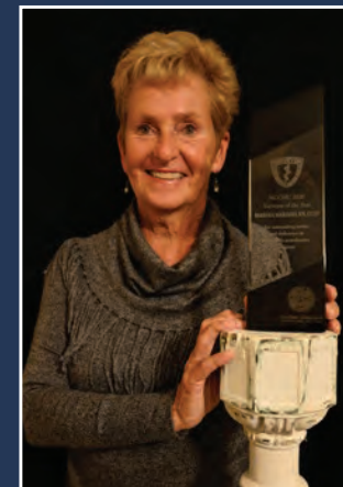
Surveyor of the Year