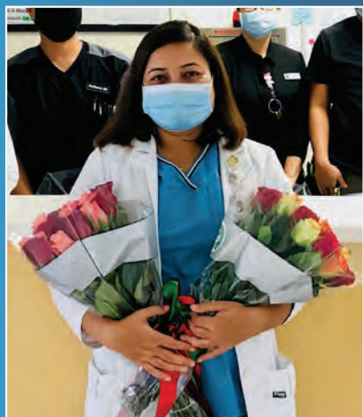
NCCHC Young Professional Award