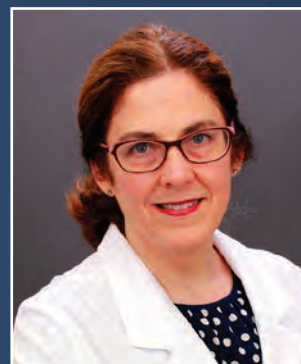
B. Jaye Anno Award of Excellence in Communication

Complejo Correccional de Bayamón, Puerto Rico, Transformative Education Institute